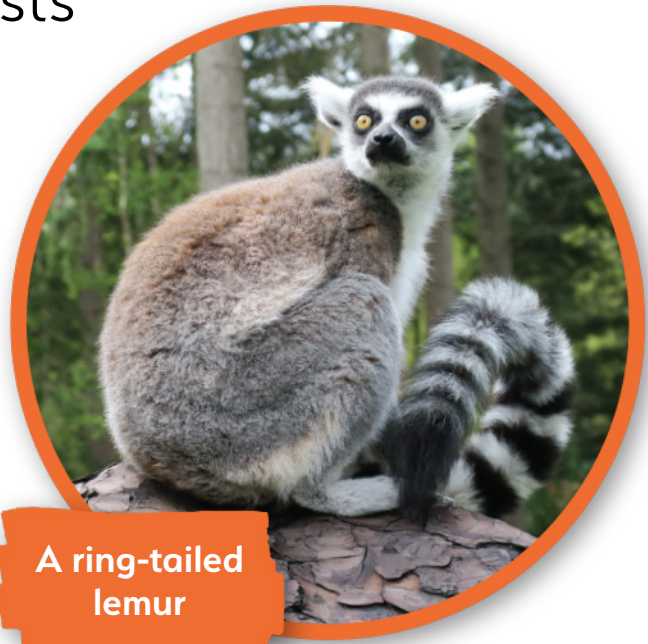
A ring-tailed lemur

The aye-aye was a mystery when it was first discovered deep in the forests of Madagascar. Scientists had never seen an animal with a furry tail like a fox, big ears like a bat, and large front teeth. What was it? It took over 50 years for scientists to learn that the aye-aye is a kind of lemur . Lemurs are a kind of primate .