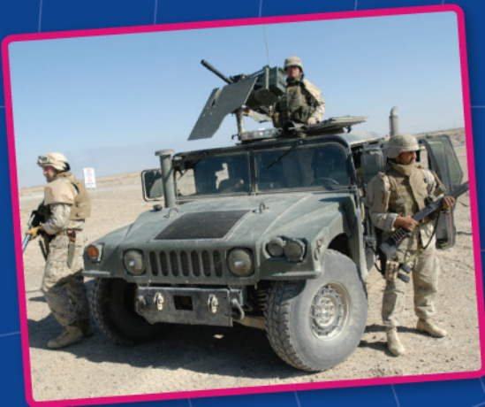
Marines in Iraq

The United States' war against terrorism expanded in 2003, when some government officials claimed that Saddam Hussein, the ruler of Iraq, was trying to build dangerous weapons, including nuclear ones. They feared he would use them against the United States and other countries. To stop him, the United States sent military troops to invade Iraq on March 20, 2003. Though the weapons were never found, the United States and its allies did remove Saddam Hussein from power.