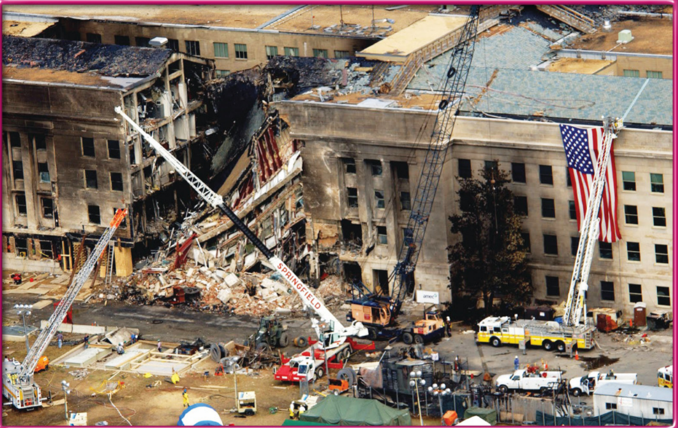
The Pentagon after being attacked on September 11, 2001

The same morning, a plane flew into the Pentagon in Virginia and another one crashed into a field in Pennsylvania. The United States learned later that day that the four planes had been hijacked by members of a terrorist group called Al Qaeda . In all, nearly 3,000 people died. Al Qaeda's leader, Osama bin Laden, had organized the attack on the United States from his base in Afghanistan. Leaders in the United States decided the camps where Al Qaeda trained its soldiers needed to be destroyed. So in October 2001, the U.S. government sent troops to Afghanistan.