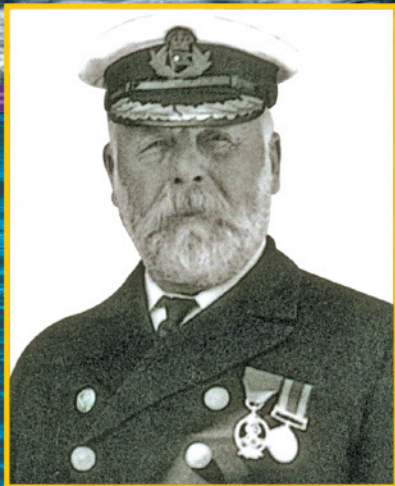
Captain Edward J. Smith

Along with about 25 other men, Jack Thayer survived the long night at sea on an overturned lifeboat.