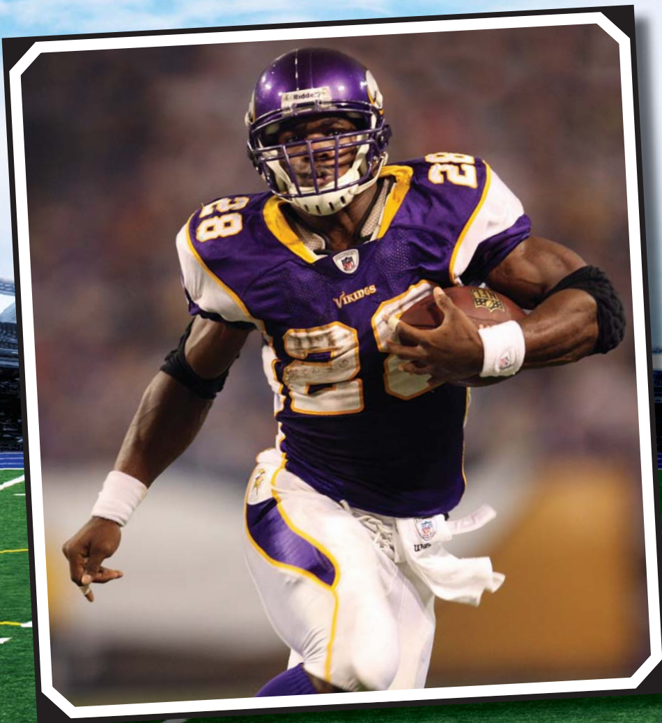
Minnesota Vikings running back Adrian Peterson carries the ball downfield during a game against the Seattle Seahawks in 2009.

In NFL offenses , the players who often receive the most attention are the quarterbacks. As leaders of their teams, they usually get the credit for wins or the blame for losses. Ten other players, however, take the field on each offensive play. Each one has a role in gaining yards and scoring points. Each one is important in helping his team win.