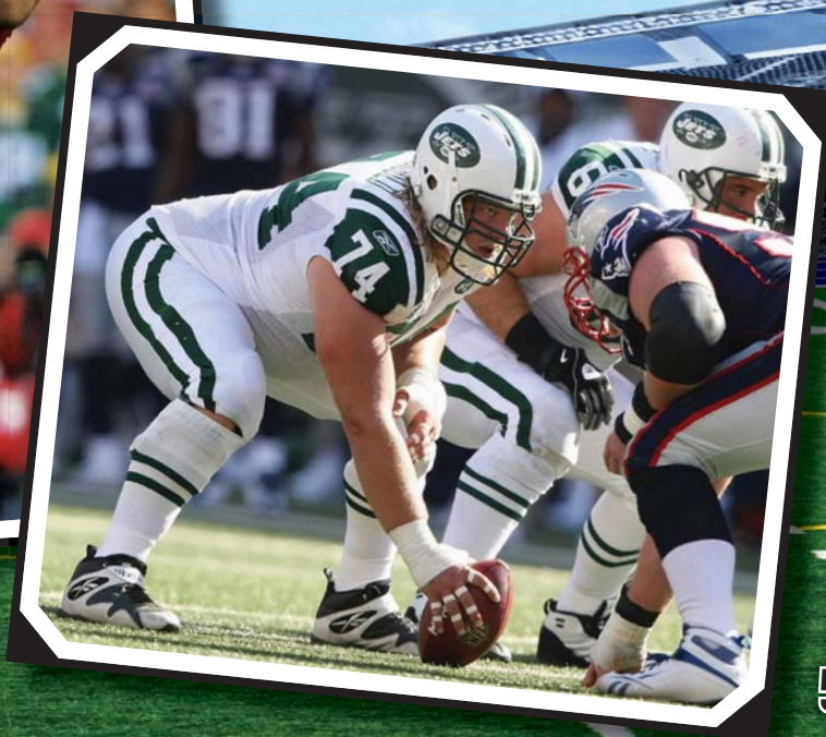
New York Jets center Nick Mangold (#74) gets ready to snap the ball in a 2009 game against the New England Patriots.