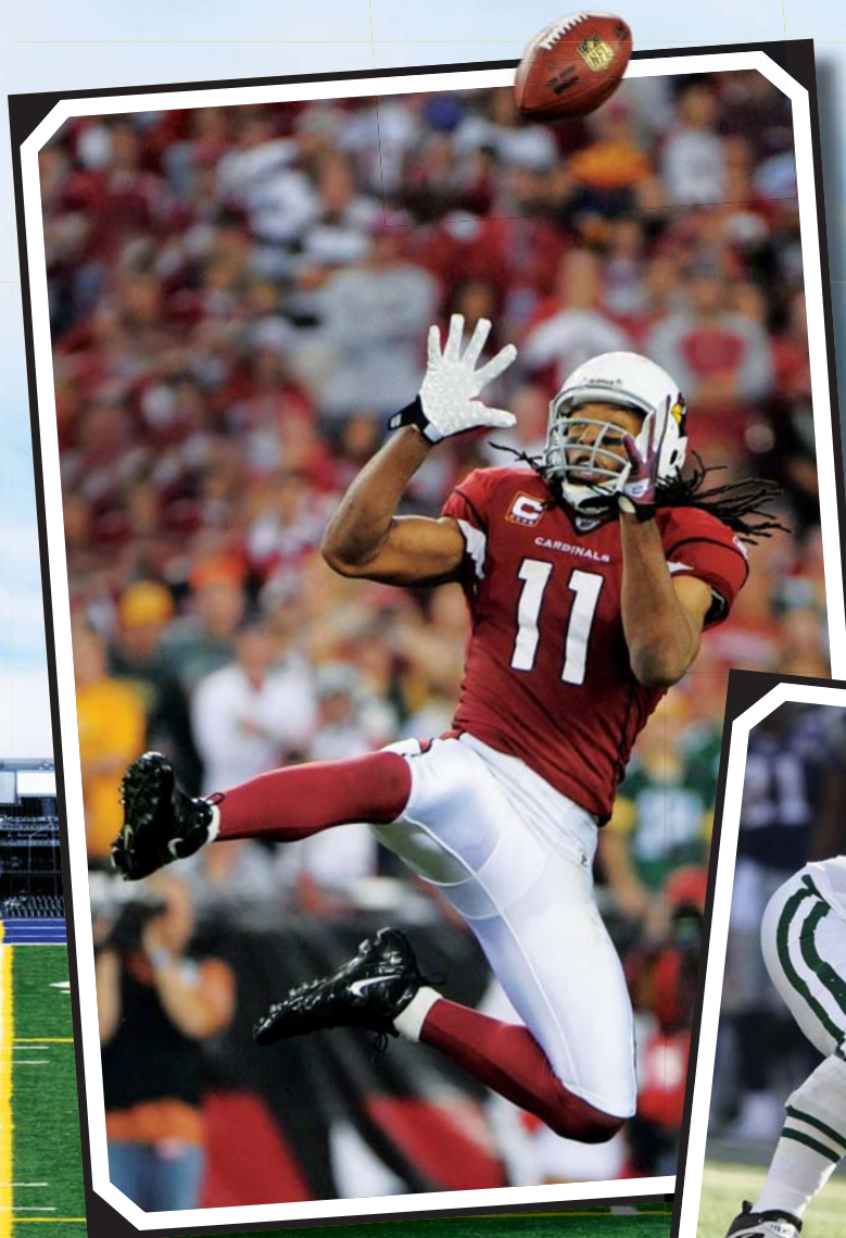
Arizona Cardinals wide receiver Larry Fitzgerald goes to make a catch in a game against the Green Bay Packers in January 2010.

This book features the talented athletes who play at the different offensive positions. You will learn about running backs , such as Chris Johnson, Adrian Peterson, and Le’Ron McClain, who carry the ball. You’ll meet Andre Johnson, Larry Fitzgerald, and Dallas Clark, the receivers who catch the passes. You will also discover hard-working players on the offensive line , such as Ryan Clady and Nick Mangold, who contribute to every play. Each one is a star of the offense!