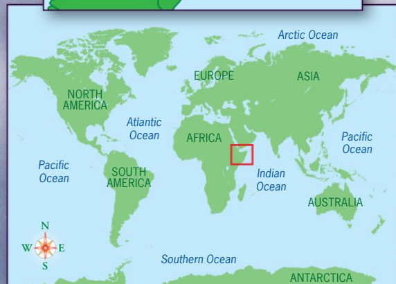
Somalia is the easternmost country on the mainland of Africa.