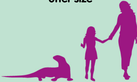
Adult giant river otter size

They can grow to be six feet (1.8 m) long and weigh up to 75 pounds (34 kg).