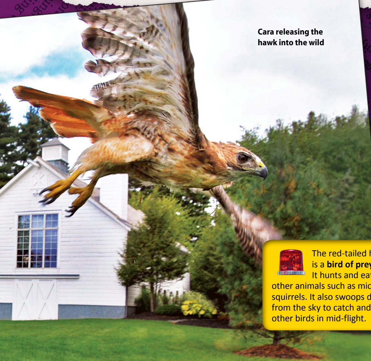
Cara releasing the hawk into the wild

For two months, Cara patiently cared for the injured hawk. She even fed it rats and mice. As its wing healed, the red-tailed hawk grew stronger. Finally, in September, Cara felt that the hawk was ready to be released into the wild. She took the bird back to the farm where it had been found. Holding the hawk in her hands, Cara let go of the animal and watched it soar into the sky.