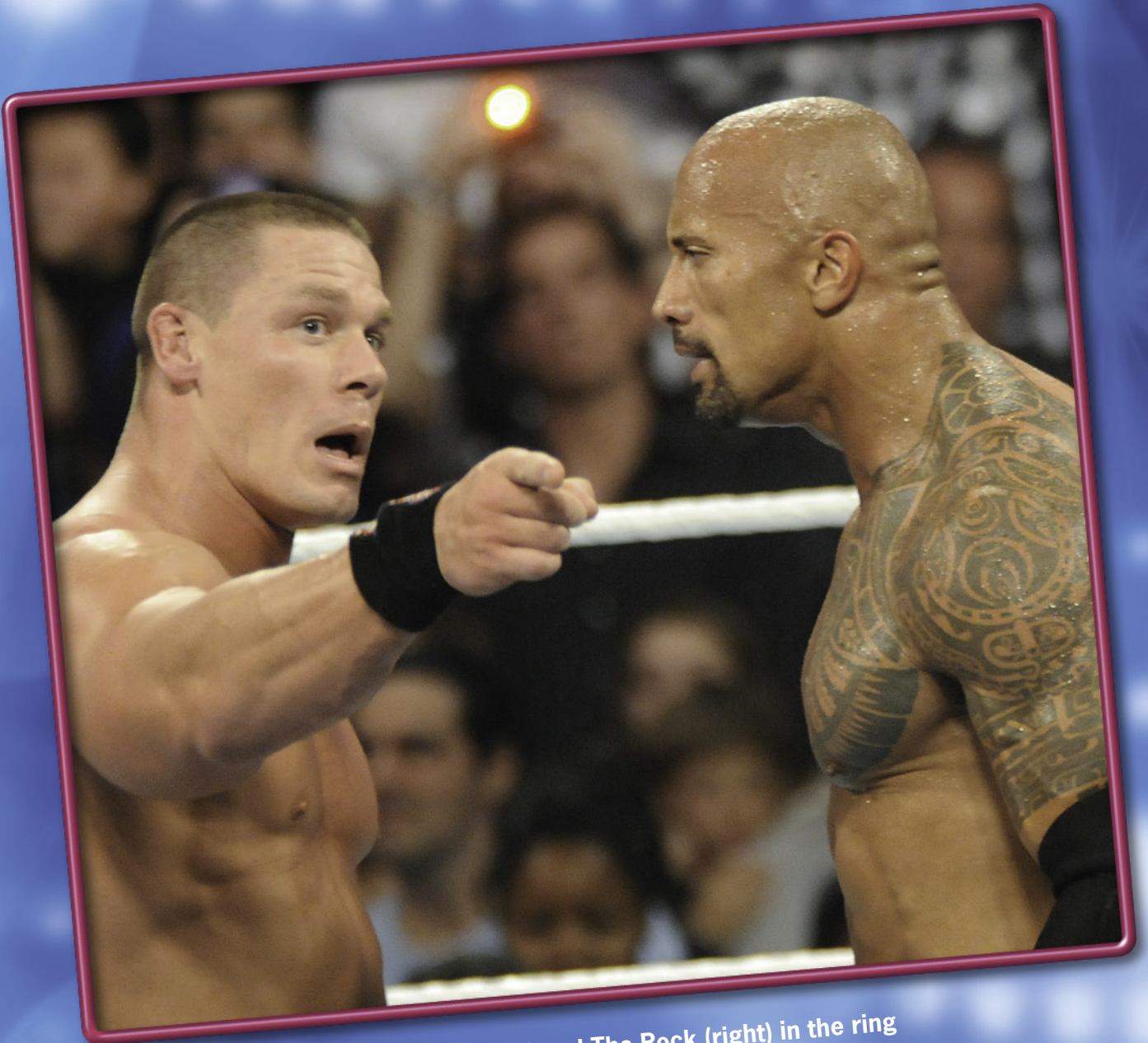
John Cena (left) and The Rock (right) in the ring

To defeat the powerful opposing duo —The Miz and R-Truth—The Rock would need to rely on his old wrestling skills. Did he still have the power, technique , and fury that had once made him a champion? The world was about to find out!