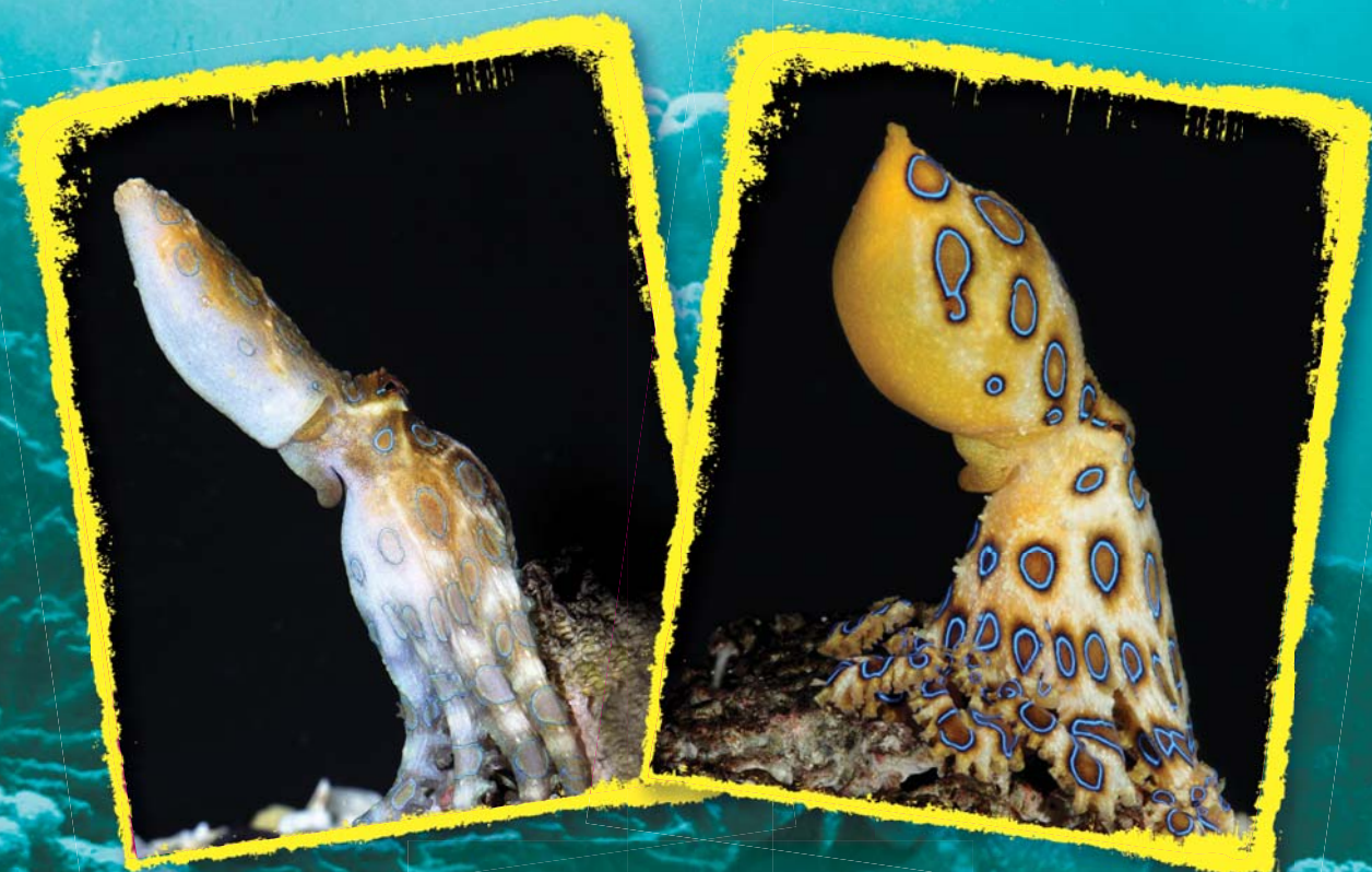
A blue-ringed octopus before and after it shows its blue markings

Anthony picked up the little brown creature. As he held it, something surprising happened. Bright blue lines and rings appeared on its skin. The boy didn't know it, but the blue markings meant danger. The little creature was a blue-ringed octopus—the only kind of octopus that is known to be deadly to people. Its change in color was a sign that it was about to bite.