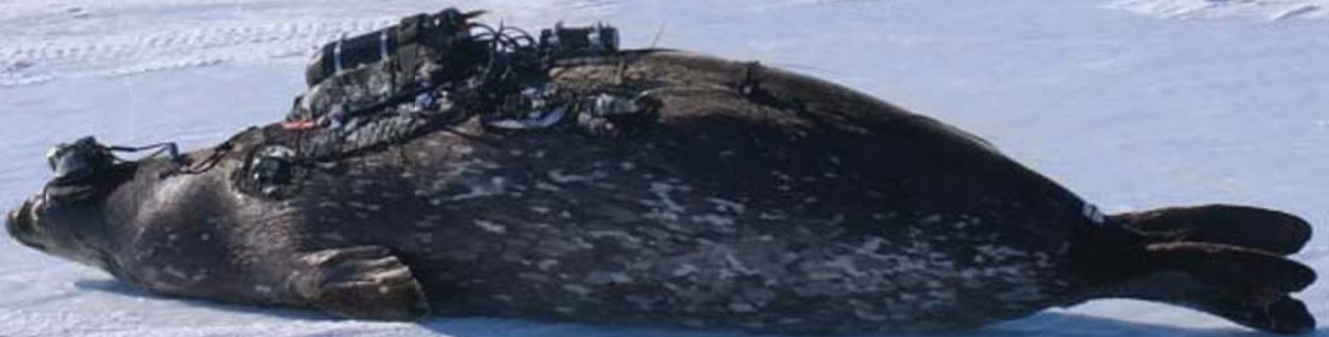
A tagged seal