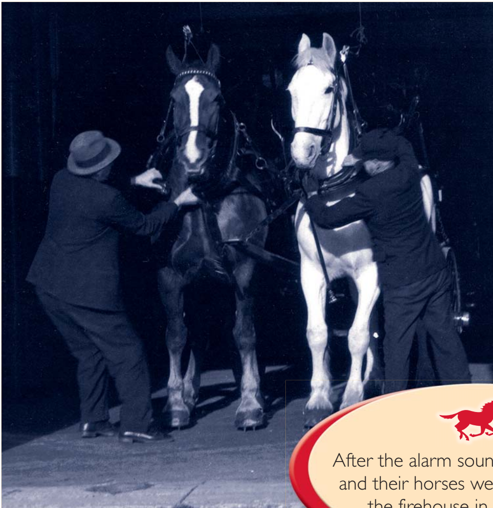
Doll (left) and Bill (right) being harnessed

O'Neill hitched the animals to the truck and climbed up into the seat. Grabbing the reins , O'Neill shouted to the horses, "Let's go, Bill and Doll! We have to stop that fire!" They raced out the front door.