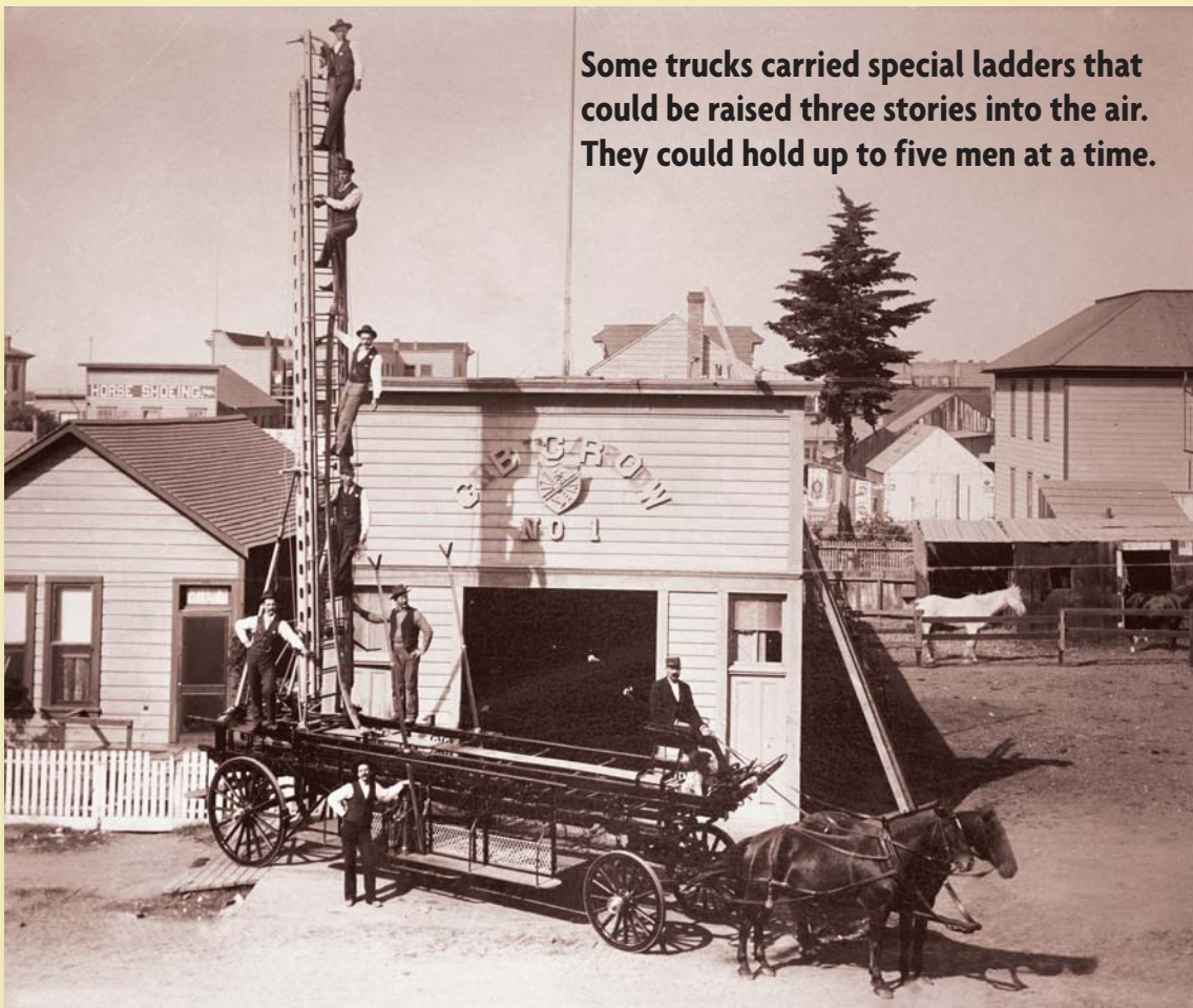
Some trucks carried special ladders that could be raised three stories into the air. They could hold up to five men at a time.

Finally, they arrived at the scene. Thanks to Bill and Doll's speed, the fire had not spread too far. The horses bravely pulled the truck near the red-hot flames. Once the ladders were unloaded, a fireman moved Bill and Doll away from the fire. They waited patiently as the firemen battled the blaze. At last, the flames were out. The city was safe!