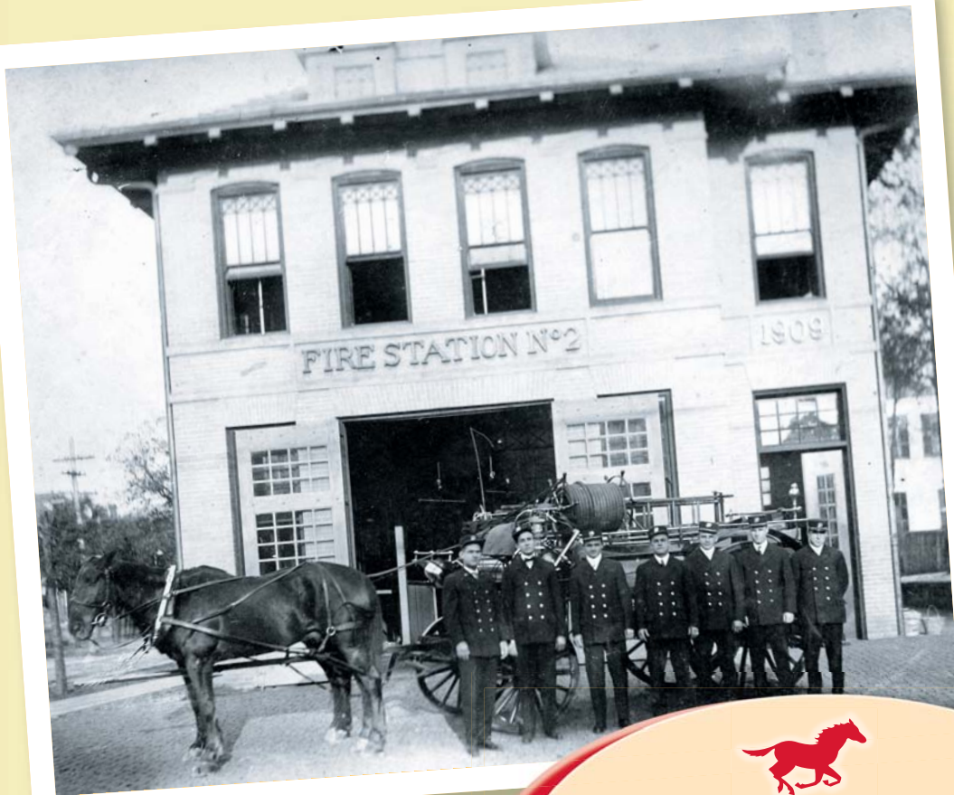
Firefighters stand in front of a hose wagon

Bill and Doll galloped along the city streets. Doll slowed down as they climbed a hill. Bill turned his head and nipped her neck. He wanted her to run faster. Bill knew their job was important. A fire could spread quickly and cause a lot of damage.