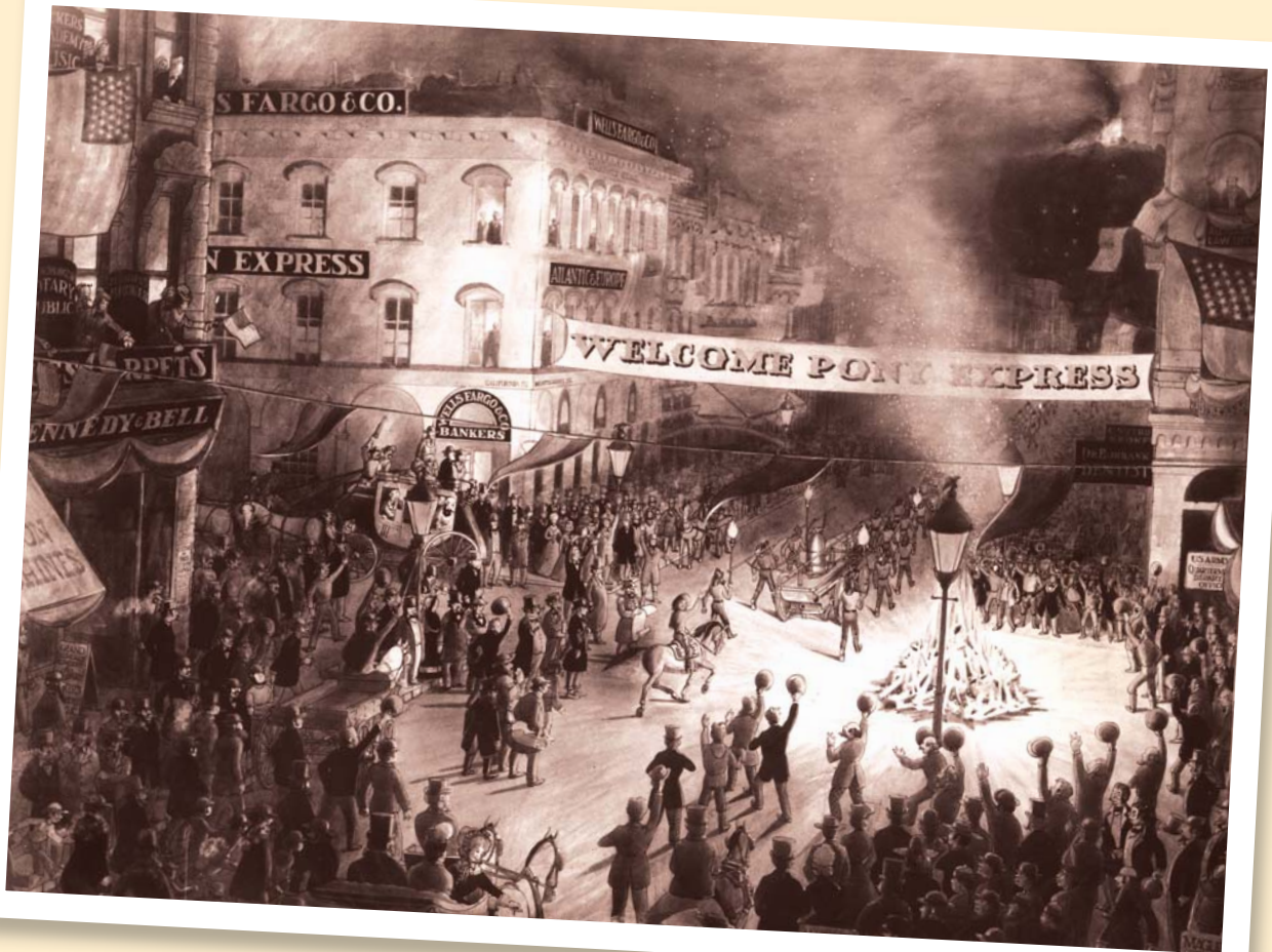
In Sacramento, Billy Hamilton was given a hero's welcome.

When Billy arrived in Sacramento, he was greeted with a brass band and a big parade. It had taken more than 15 riders and 150 horses to carry the mail across the country by Pony Express. Horse by horse, rider by rider, the mail had traveled 1,966 miles (3,164 km). The trip had taken just ten days. Now that kind of speed was something to celebrate!