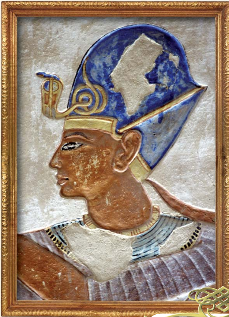
Painting of pharaoh Ramesses III

The pharaoh was all-powerful. His word was law. Everyone paid taxes to the pharaoh. Many Egyptians used crops or animals to pay taxes. They also paid by working for the ruler. They built his palaces—and his tomb.