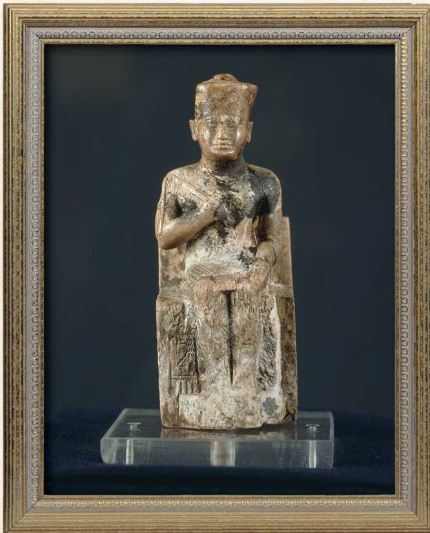
Khufu ruled Egypt from about 2551 to 2528 B.C. This small statue, about 3 inches (8 cm) tall, is the only record of what he looked like.

As the Egyptians stepped off the boat, they saw 20,000 workers. Many were cutting giant blocks of limestone. Others were pulling huge stones up the slanted sides of a building. All had come at the command of their king, Khufu (KOO-foo). They were doing the most important work of their lives. They were building Khufu's tomb —the Great Pyramid.